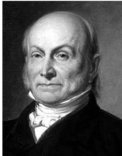
John Quincy Adams